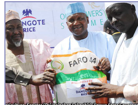
Lauching Dangote Rice