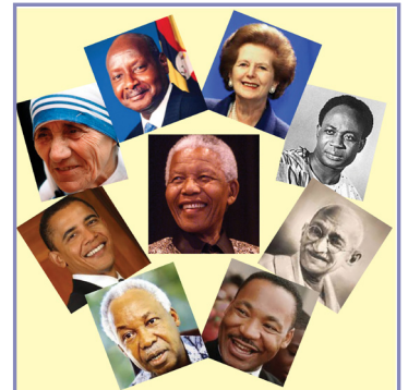
Lead To Serve