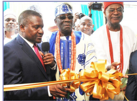
Aliko Dangote unveils Nigeria's first Fintech Bank