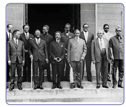
Obote with other heads of state