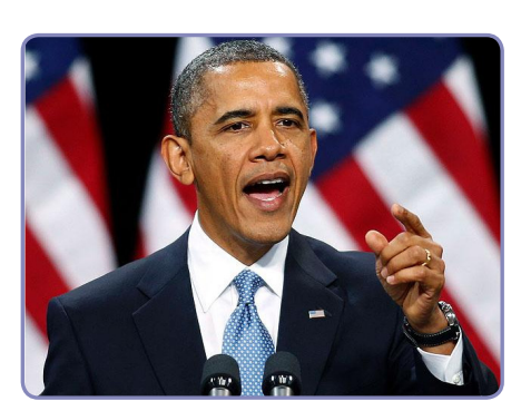
Addressing the nation