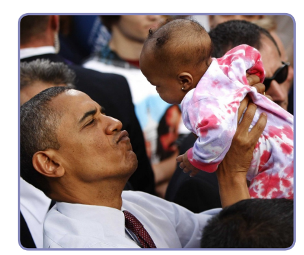
Obama carrying a baby during a tour