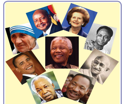
Lead To Serve