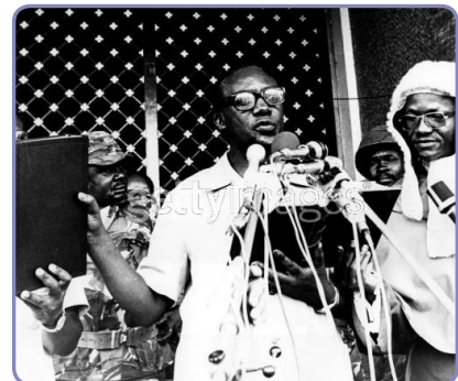
Prof Yusuf Lule being sworn in as President