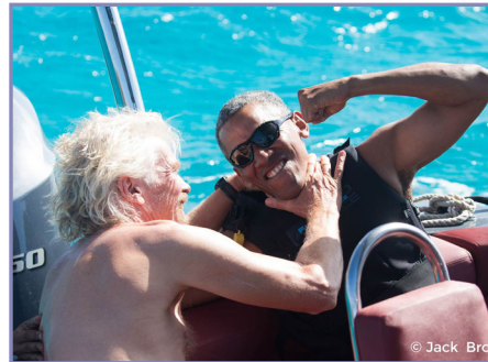
Obama with Branson in Mosquito on the British Virgin Islands

For more information visit the Wikipedia insight and Google page