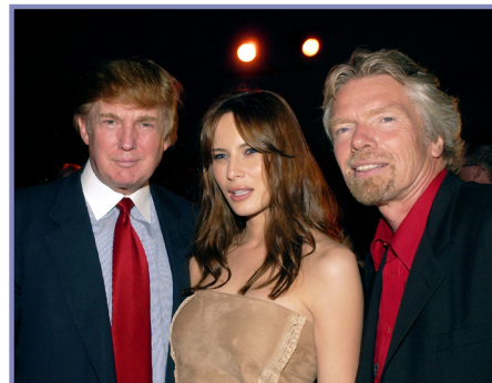
Billionaire Donald Trump, Melania Trump and media mogul Sir Richard Branson