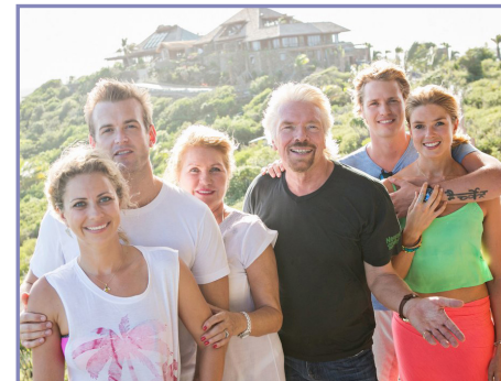
Richard Branson with his family