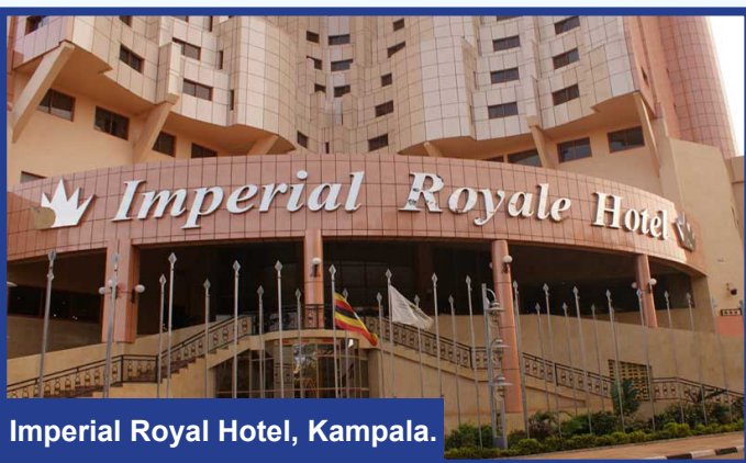
Imperial Royal Hotel, Kampala.

Members receive benefits from the Centre activities like discounts on training programmes, access to the Centre's resource centre among others.