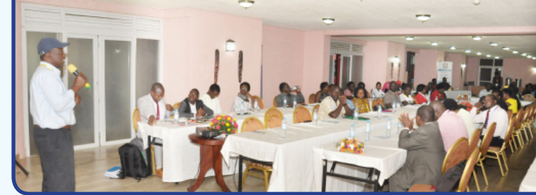
Some of the participants at a Leadership Training